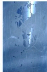
NATSOUMI Untitled (or Déconstruction II) , 2024 Price on Request Galerie Springer Berlin CONTACT GALLERY