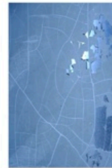
NATSOUMI Untitled (or Déconstruction IV) , 2024 Price on Request Galerie Springer Berlin CONTACT GALLERY