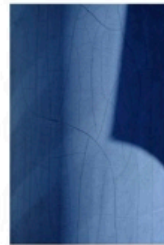
NATSOUMI Untitled (or Crackle) , created: 2024 Price on Request Galerie Springer Berlin CONTACT GALLERY