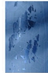
NATSOUMI Untitled (or Déconstruction III) , 2024 Price on Request Galerie Springer Berlin CONTACT GALLERY